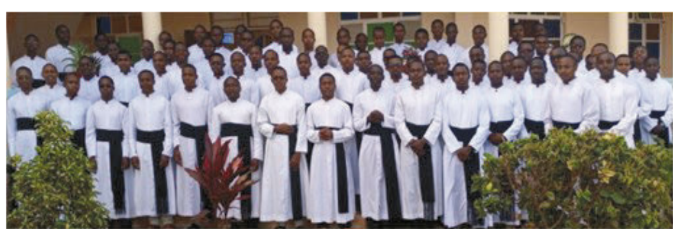
All of the seminarians of the Apostolic Life Community of Priests in Tanzania